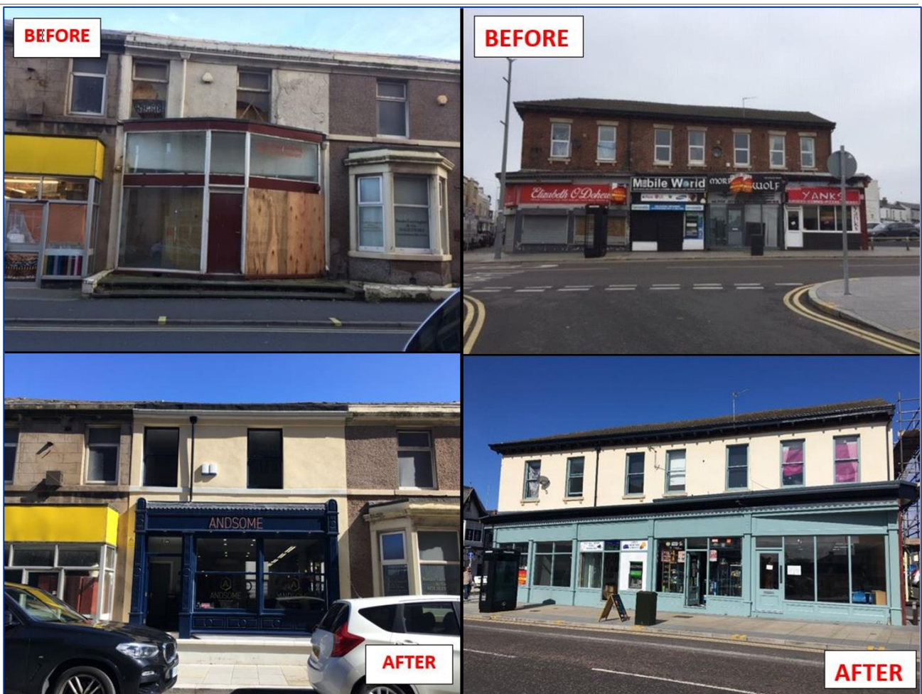
Image 2: town centre public realm improvements made to Edward street (left) and church street (right)

As part of adopting a 'pedestrian first' approach, the council has been and will continue to consider opportunities to pedestrianise parts of the town centre, as these allow for the development of pleasant and attractive urban spaces which are not dominated by cars. Such schemes may include pedestrianisation for the majority of the day, with limited access for service vehicles and taxis / buses outside of these hours. In the town centre there has already been a progressive pedestrianisation programme which has closed many