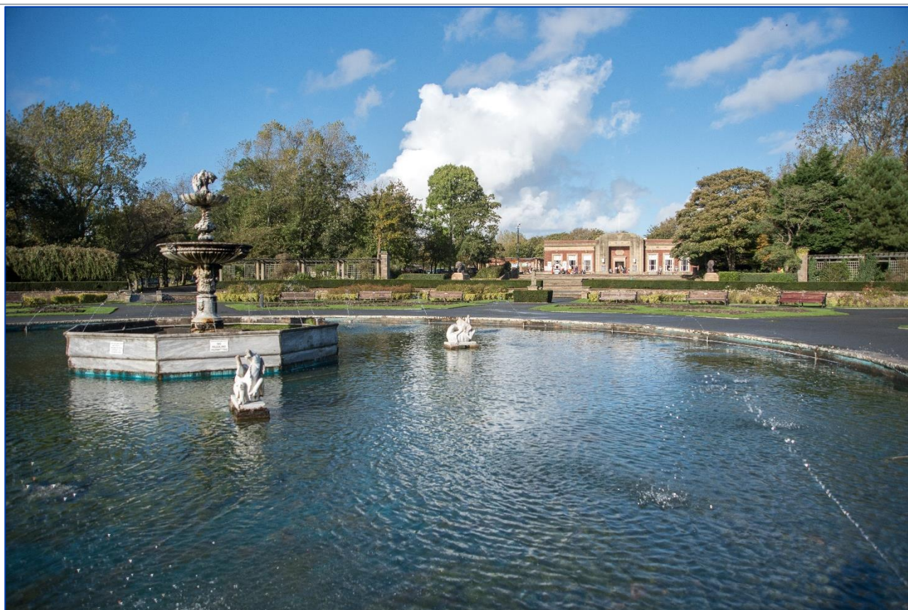
Image 4: Blackpool's Stanley Park